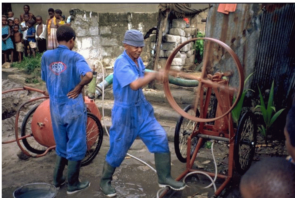
Figure 1: The MAPET, developed by the Dutch NGO WASTE, in action in Dar es Salaam

Pits can be emptied manually using either scoops or by flushing the contents through a hole in the lining into an adjacent pit. In the absence of a viable and affordable tanker service, these methods are the only options and are widely practised where the abandonment of the latrine is not considered an option due to space or cost concerns.